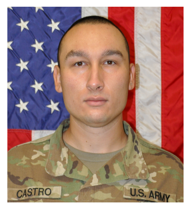
CDT Fidel Castro Cadet Battalion Command Sergeant Major

"Check up on your cadets. Sometimes it's a good idea to ensure that something reached the lowest level by calling and checking in on the lowest level."