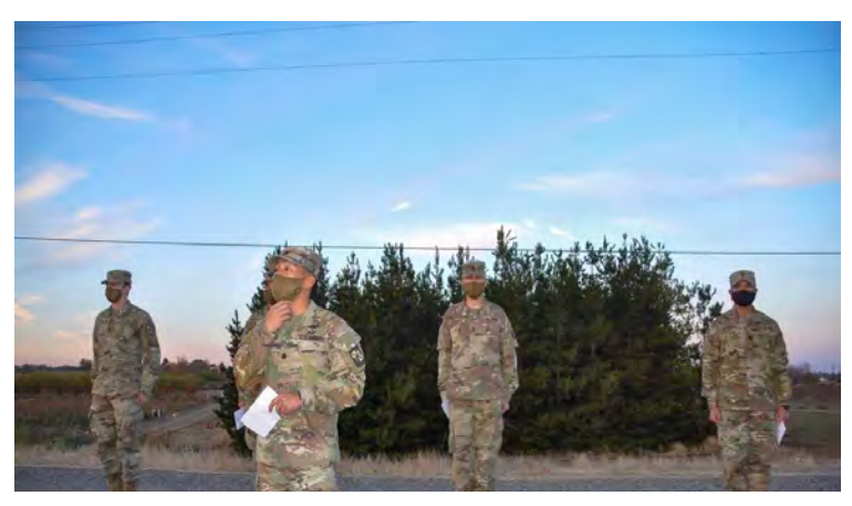
Branching ceremony for the MSIVs.