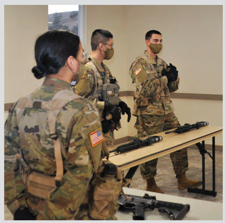
Cadets conducting a weapons safety brief while adhering to social distancing procedures.