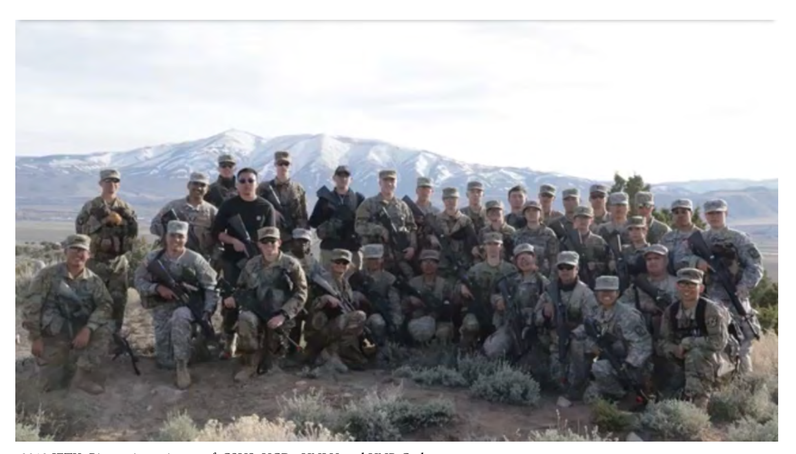
2019 JFTX. Picture is a mixture of CSUS, UCD , UNLV and UNR Cadets.