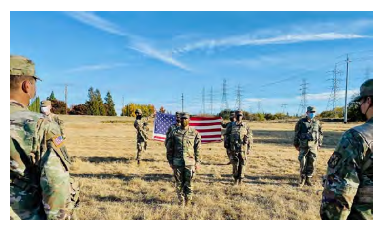
Contracting ceremony at CSUS.

In November, we held a contracting ceremony to welcome the new members of the team and their commitment to become future leaders in the U.S. Army. We also had the honor to watch the faces of our MSIVs and MSVs after discovering the branch they were assigned!