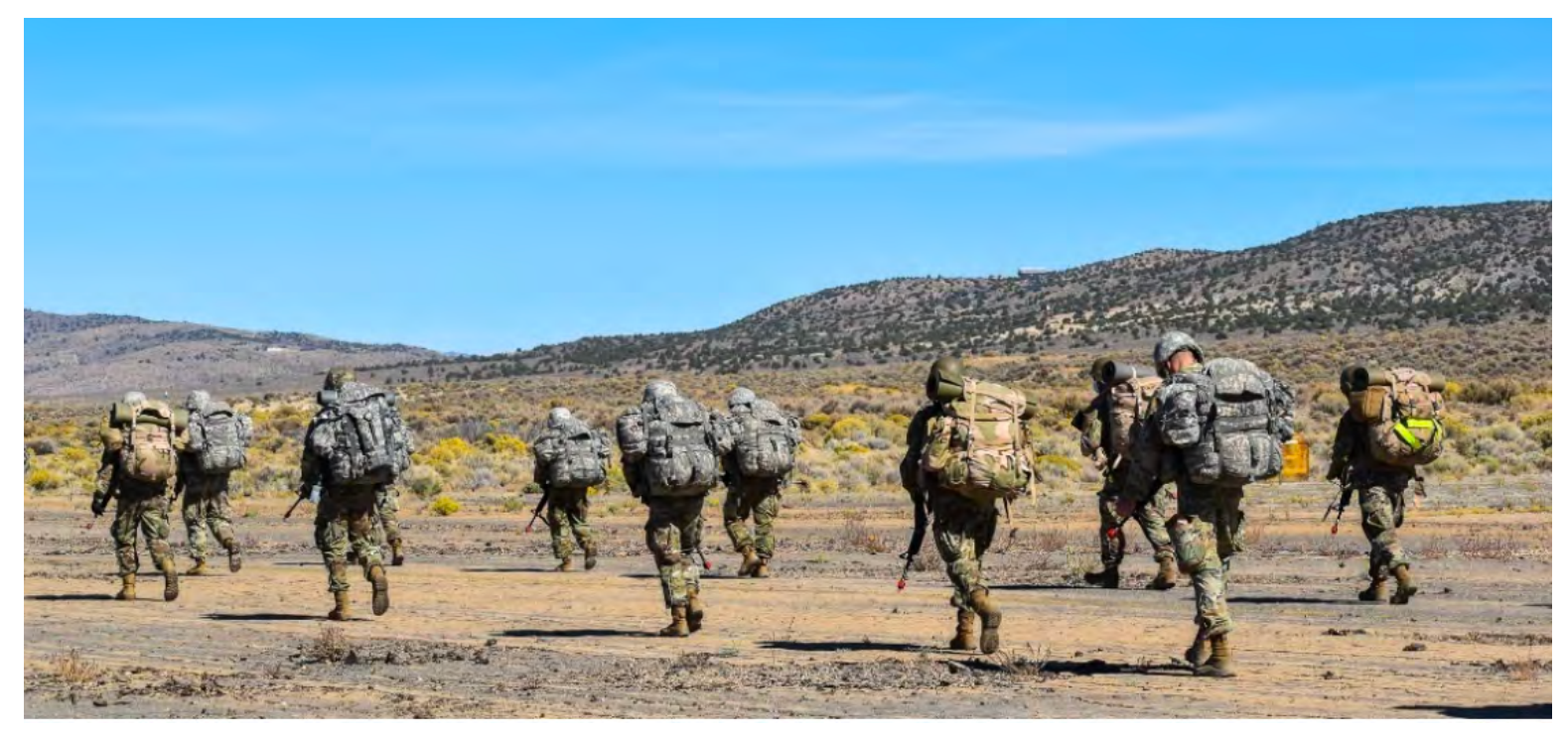
Cadets conducting a road march during Operation Agile Leader in Reno, Nevada.