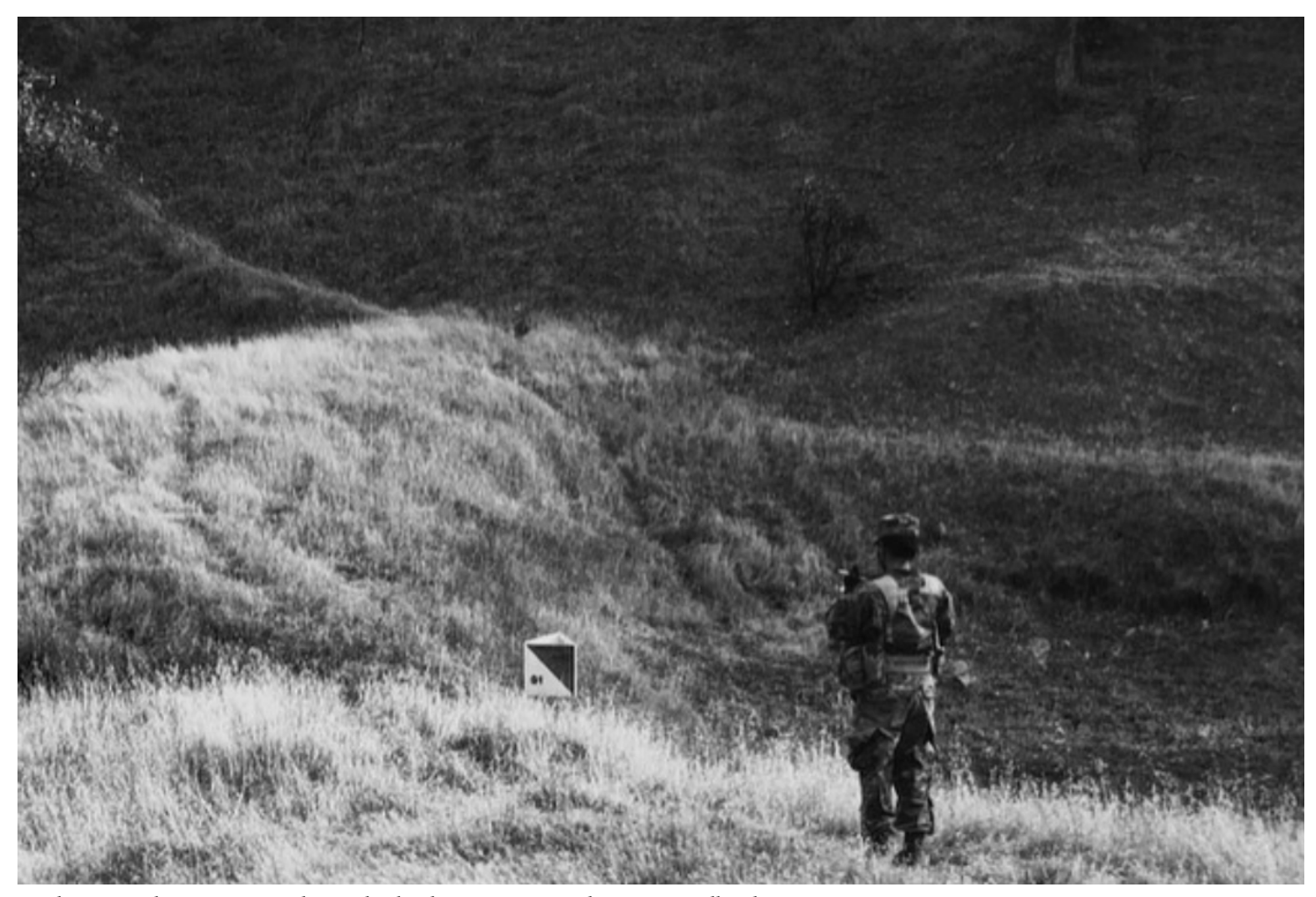
Cadet Angara locating a point during day land navigation at Judge Davis Trailhead.